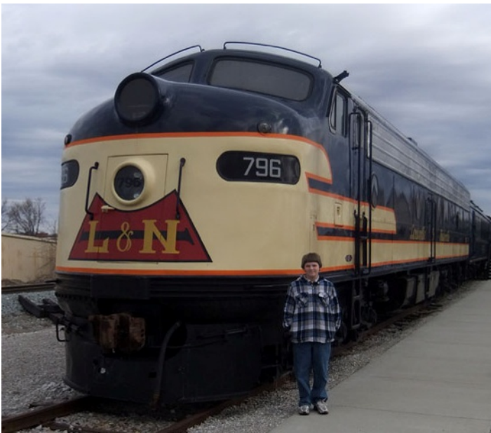
Chuck Hinrich's grandson in front of E8 796